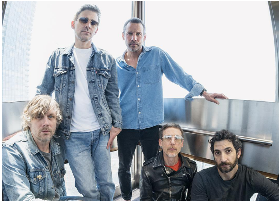
Sam Roberts Band