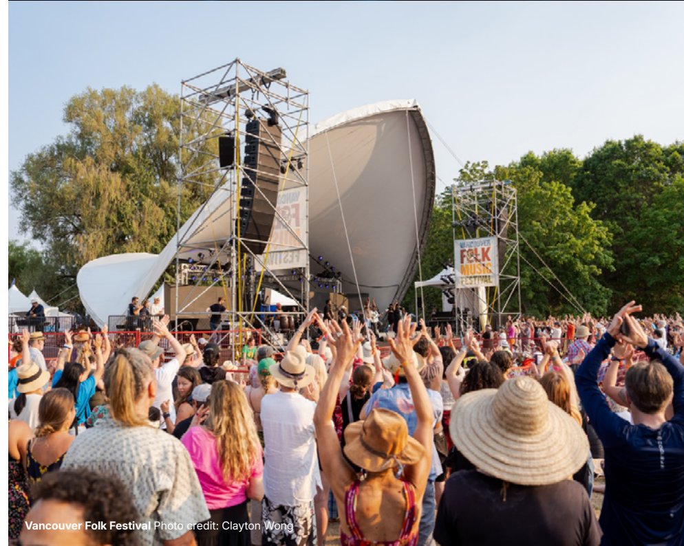
Vancouver Folk Festival