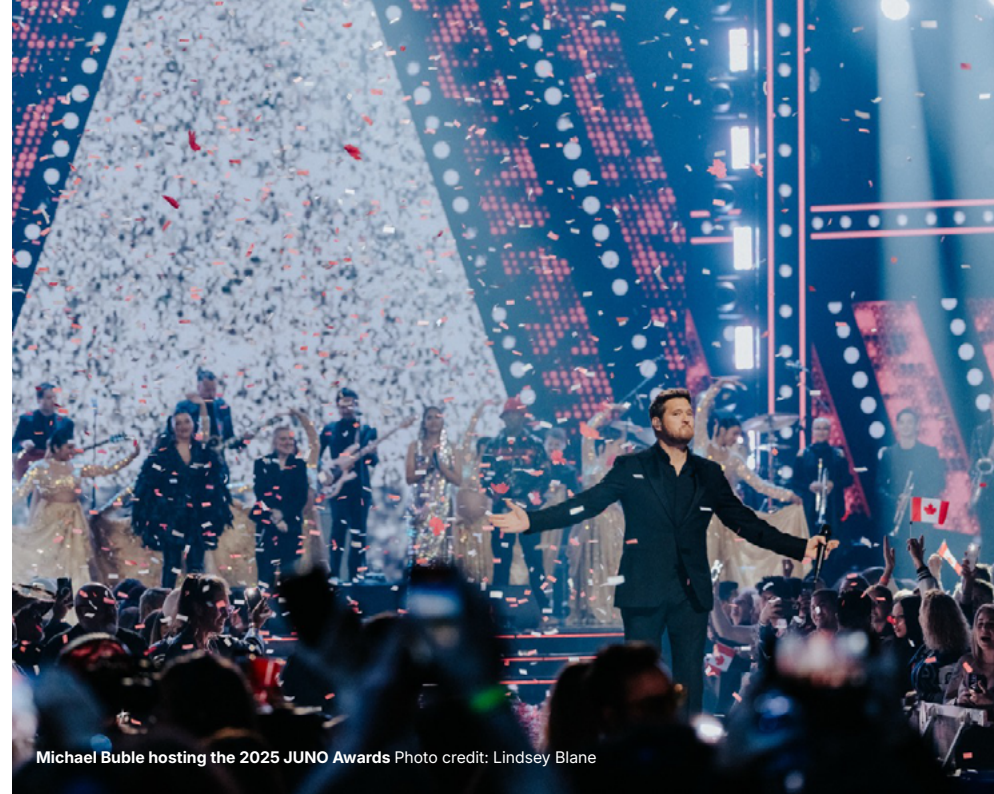
Michael Buble hosting the 2025 JUNO Awards

Creative BC is exploring how best to approach this work, including potential pathways for engaging qualified researchers and culturally appropriate partners.