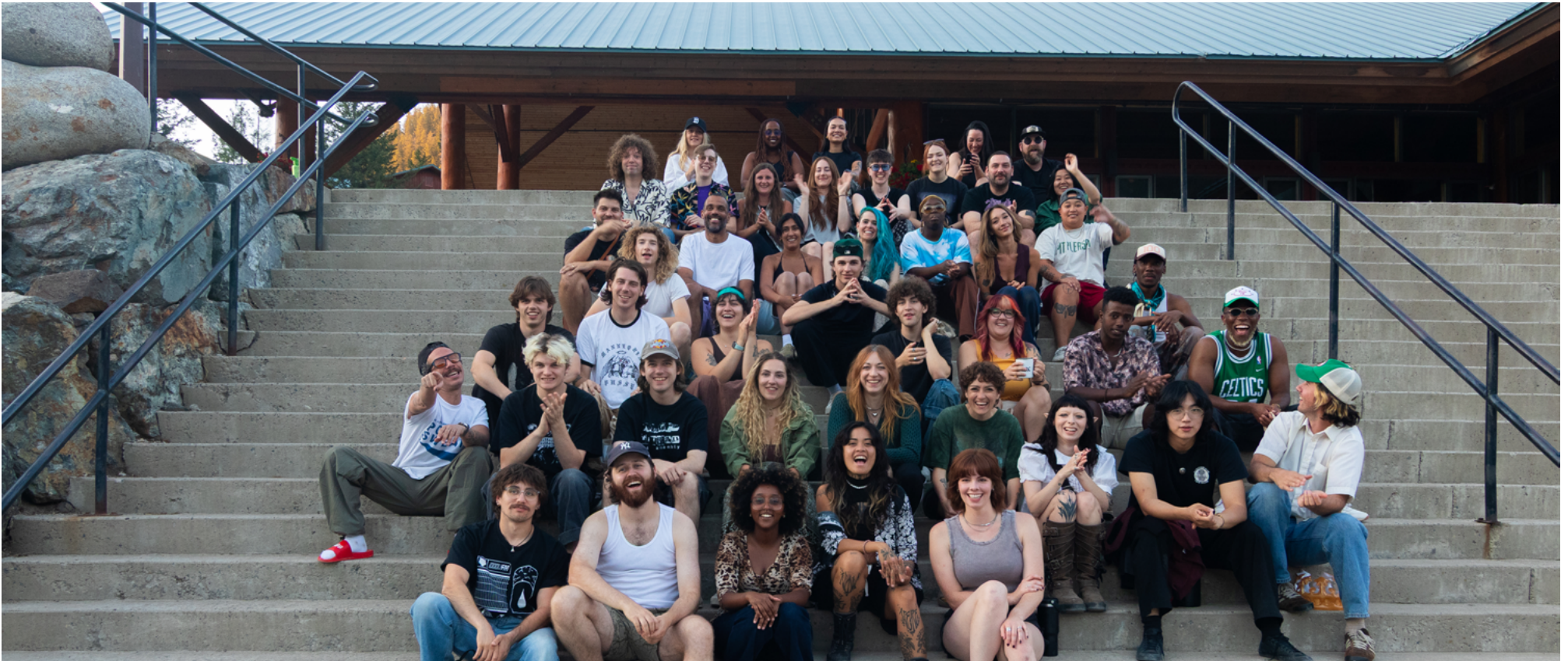
ARC Program 2025 Cohort

These relationships have been in place since the start of the provincial music fund. Creative BC supports these partnerships through crosspromotion, collaboration and shared networks. FPCC reports to Creative BC in March each year, and Music BC reports to Creative BC in October.