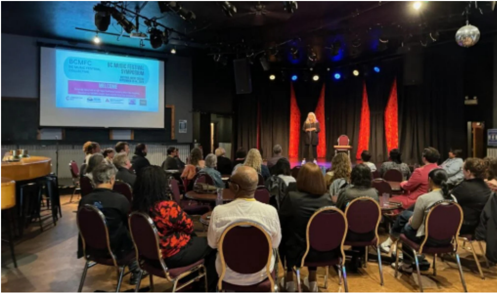
Honourable, Lana Popham, Minister of Tourism, Arts, Culture and Sport welcoming us with some remarks on Friday and Open Space Discussion on Saturday Morning. (2024)